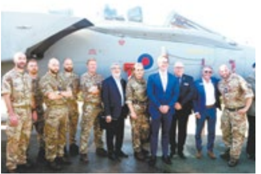
The handing over with the JARTS team

After over three years of detailed planning and a huge amount of co-operation, passion and teamwork between dozens of dedicated people at the RAF, RAAF and RAAFA, the Aviation Heritage Museum WA has welcomed its latest exhibit.