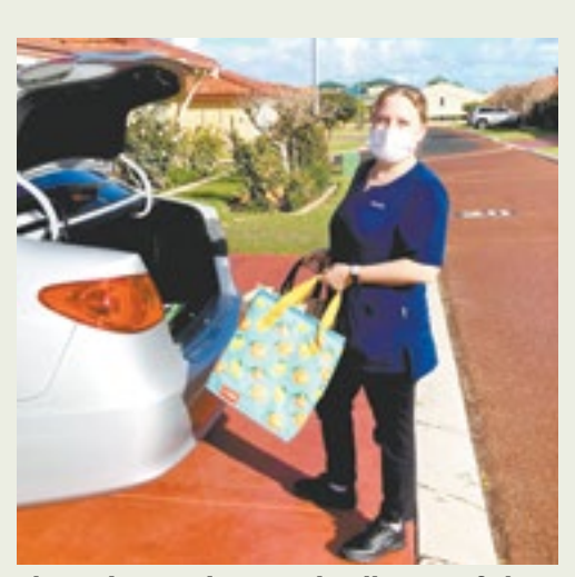
Shopping assistance is all part of the service

The organisation also provides services to help people at home, including showering, medication management, cooking meals, doing laundry, cleaning and generally whatever might be needed.