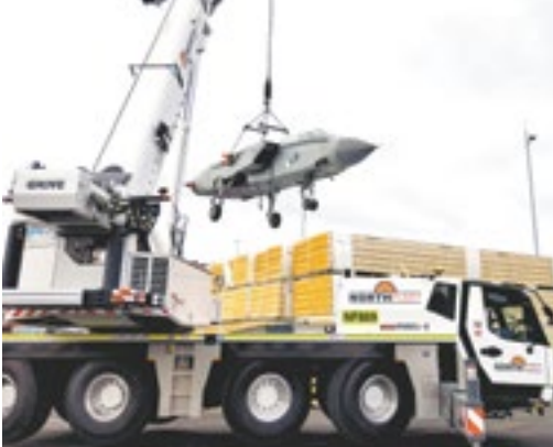
Unloading at Fremantle Port